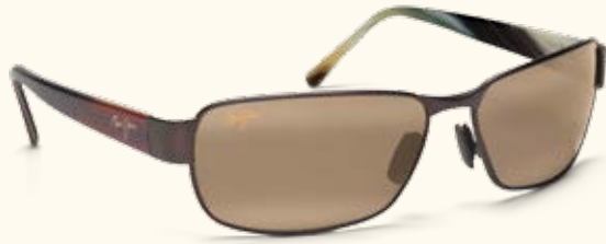
New - Available Now BLACK CORAL Rx-able

ST Glass/Monel-Acetate eye size: 65, bridge: 16, temple: 130 249-2M Matte Black/Neutral Grey H249-19M Matte Espresso/HCL Bronze