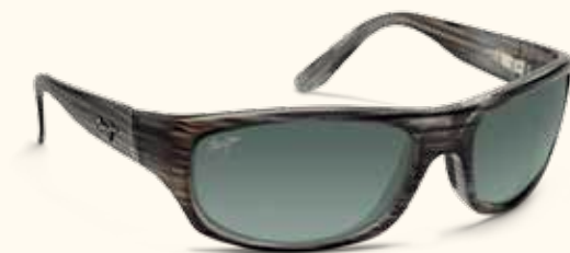
New - Coming Soon SURF RIDER 261 Rx-TBD ST Glass/Nylon For frame information talk to your sales rep.