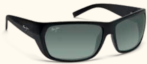
New - Coming Soon WAIMEA CANYON 265 Rx-TBD ST Glass/Nylon For frame information talk to your sales rep.