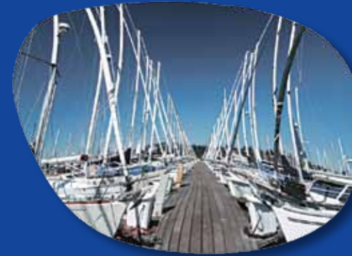
CONVENTIONAL RX LENS