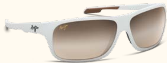
ISLAND TIME Rx-able ST Glass/Nylon eye size: 64, bridge: 17, temple: 129 237-2M Matte Black Rubber/Neutral Grey 237-11B Titanium/Neutral Grey H237-15 Striped Rootbeer/HCL Bronze H237-05M Matte White/HCL Bronze - NEW