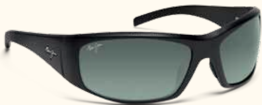
New - Coming Soon DORADO 259 Rx-TBD Maui Evolution/Nylon For frame information talk to your sales rep.