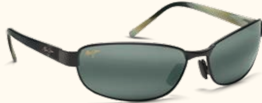
New - Available Now NAPILI BAY Rx-able

ST Glass/Monel-Acetate eye size: 65, bridge: 16, temple: 130 249-2M Matte Black/Neutral Grey H249-19M Matte Espresso/HCL Bronze