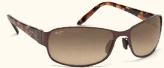
New - Coming Soon MAKENA Rx-TBD

ST Glass/Monel-Acetate eye size: 65, bridge: 17, temple: 140 256-2M Matte Black/Neutral Grey H256-19M Matte Espresso/HCL Bronze