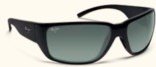
New - Coming Soon SEAWALL 235 Rx-TBD ST Glass/Nylon For frame information talk to your sales rep.