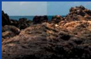
1. Variation in the rocks is crisper and more pronounced.

Since our humble beginnings on the beaches of Maui, we have been committed to honing our craft and creating sunglasses like no other. Sunglasses that provide advanced protection from the glare and harmful rays of the sun without distorting the beautiful colors that surround us. That's why Maui Jim is the only company to offer PolarizedPlus2® lens technology. It eliminates glare and boosts color so blues are truer, greens are brighter and reds are more vibrant. It's why many say Maui Jim is the lae'ula of lens technology.