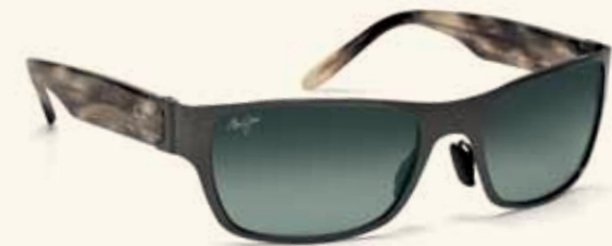
New - Coming Soon KAMUELA Rx-TBD

ST Glass/Monel-Acetate eye size: 57, bridge: 18, temple: 130 122-02 Gunmetal Black/Neutral Grey H122-19 Espresso/HCL Bronze