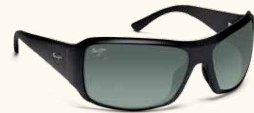
New - Coming Soon NINE PALMS 255 Rx-TBD Maui Evolution/Nylon For frame information talk to your sales rep.