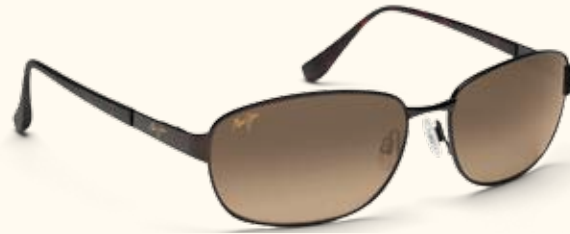
New - Coming Soon DRIFTWOOD Rx-able

ST Glass/Monel-Acetate eye size: 57, bridge: 20, temple: 135 115-02 Gloss Black/Neutral Grey H115-19 Espresso/HCL Bronze