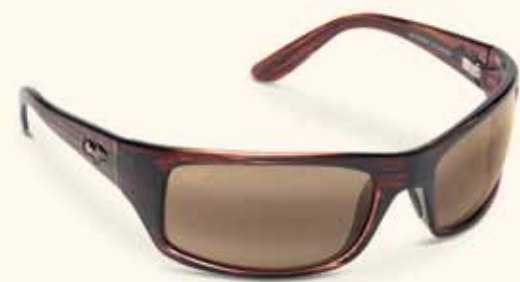
PEAHI Rx-able ST Glass/Grilamid eye size: 65, bridge: 21, temple: 125 202-02 Gloss Black/Neutral Grey H202-10 Burgundy Tortoise/HCL Bronze H202-05M Matte White/HCL Bronze - NEW H202-2M Matte Black Rubber/HCL Bronze HT202-2M Matte Black Rubber/Maui HT