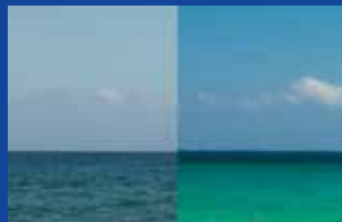
3. PolarizedPlus2® takes glare off the sky and water.

POLARIZEDPLUS2® LENS TECHNOLOGY WIPES OUT 99.9% OF GLARE. BLOCKS 100% OF HARMFUL UV. BOOSTS COLOR.